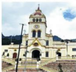
Our Lady of Egypt in Bogota.

Regarding our apostolate in Colombia, we presently serve in the cities of Medellín and Bogotá. In 1995, the Basilian Fathers established a presence in the city of Medellín by ministering in an area of town designated as a war zone by the authorities. In time, relative peace would be gradually restored. In 2023, the Archbishop of Bogotá entrusted the Basilians with the administration of the parish of Nuestra Señora de Egipto (Our Lady of Egypt). The church dates from the 17 th century. Because of a shortage of diocesan clergy, the parish had been underserved for some time; only one Mass was celebrated on Sundays, and the church was usually closed during the week. But now, with the Basilians, a new era of ministry has begun.