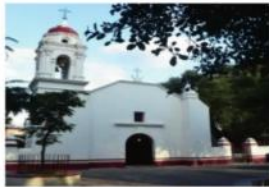
San Lorenzo parish in Tehuacán.

In 1961, the Basilian Fathers Missions expanded into Mexico and began a process of taking over at poor parishes, building them up, and giving them over to the local diocese for continued ministry. There is one parish where we have continued working for almost forty years: San Lorenzo (Saint Lawrence) in Tehuacán. We first started serving at San Lorenzo when it was a chapel of Divino Salvador in 1978. In 1987, it became a parish, and the Basilian Fathers were entrusted with it.