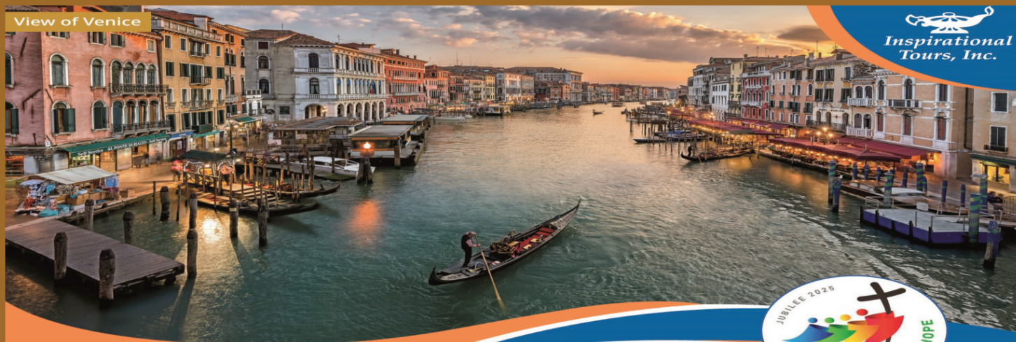
View of Venice