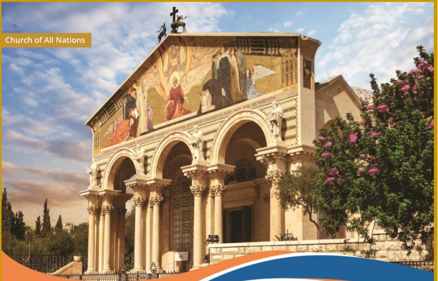
Church of All Nations