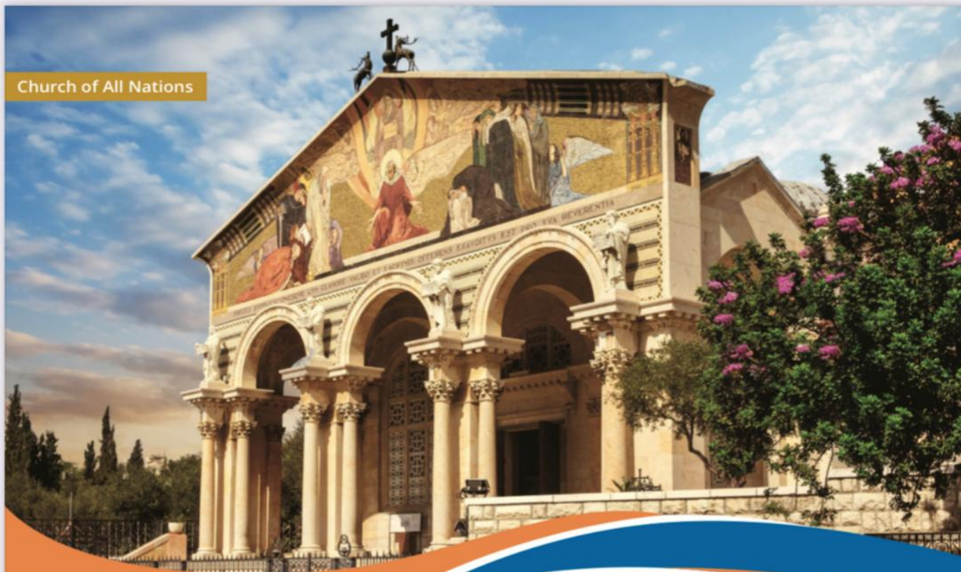
Church of All Nations