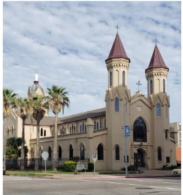
St. Mary's Cathedral Basilica 2011 Church Street, Galveston, TX