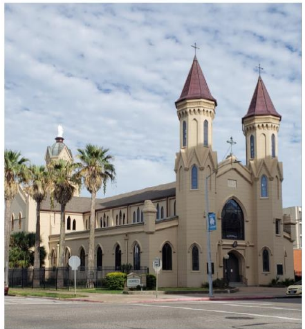
St. Mary's Cathedral Basilica 2011 Church Street, Galveston, TX

(July 5th) Mass will be at 9AM at St. Mary's only!