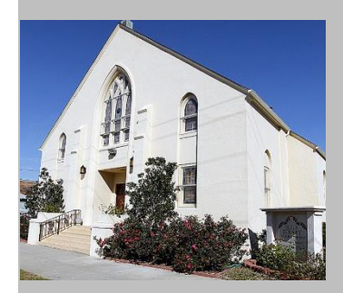
Holy Rosary Church