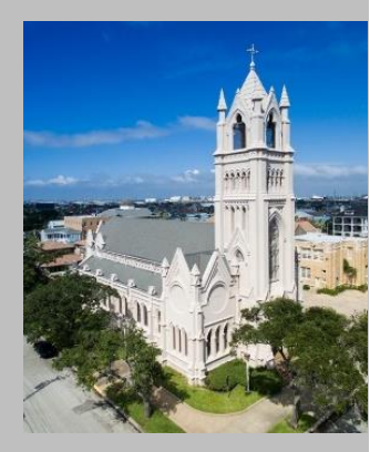
St. Patrick Church