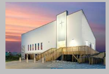
Our Lady By The Sea