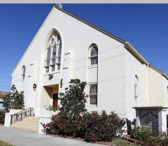
Holy Rosary Church