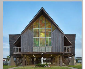
Mary Star of the Sea

Thank you for choosing Catholic Marriage and Holy Family Parish to walk with you on this beautiful journey toward marriage! It is a privilege for us to be a part of this process with you. Please be assured that our desire is to provide you the very best we have to offer to prepare for a lifelong, faith filled, and joyful Christian marriage. Just like anything else, you will only get out of something what you are willing to put in, so we encourage you to actively engage the process. Help us to serve you better! Please answer all the questions inside, honestly and if they apply to you. The answers will help us to personalize your marriage preparation process as much as possible. We look forward to working with you! --- the Marriage Prep Team