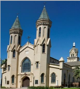
St. Mary's Cathedral Basilica