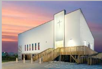
Our Lady By The Sea